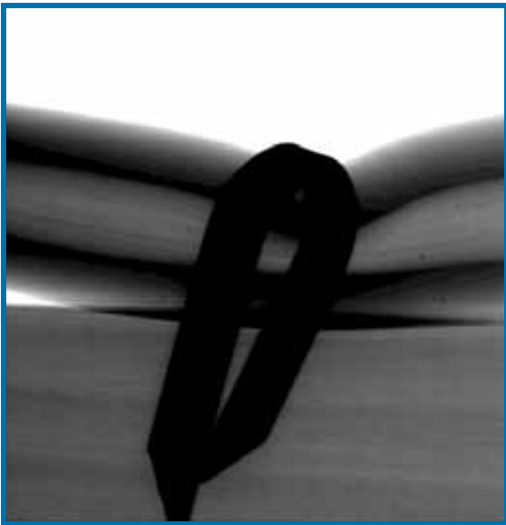
Aggressive stapling: 19 mm bend radius for fiber (minimal bending)

OFS EZ BEND ULTRA BEND INSENSITIVE OPTICAL CABLE -C- LG4.8C-001C-DRW C(UL) US TYPE OFNR [CSA OFN FT4] {lot number} ~nnnnn FEET