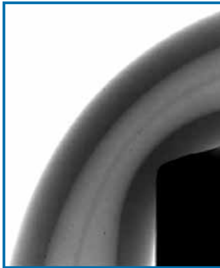
90-degree bend, stapled 3/4" from corner: 5 lb tension, 5.5 mm fiber bend radius