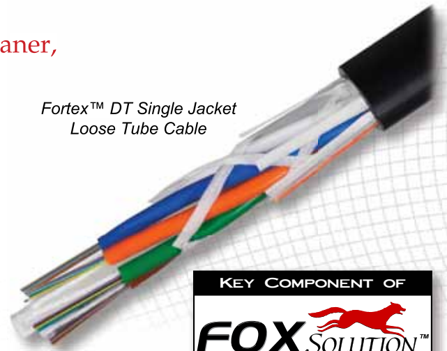
Fortex™ DT Single Jacket Loose Tube Cable

In addition to being completely gel-free, Fortex DT Single Jacket Cable offers the same high-performance features as OFS' traditional loose tube cables. Our 2.5 mm buffer